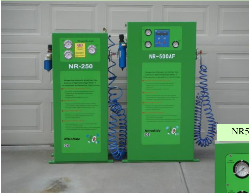
NR500AF Front Panel.