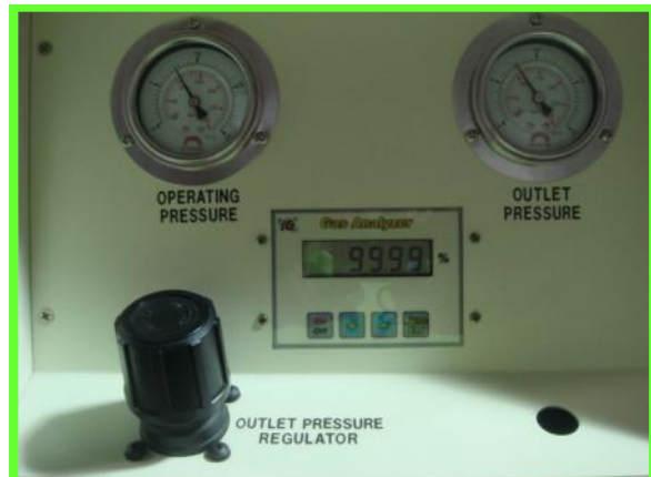
HP 3000 front panel shows the operation and outlet pressure gauges, pressure regulator and the LED Oxygen Analyzer.