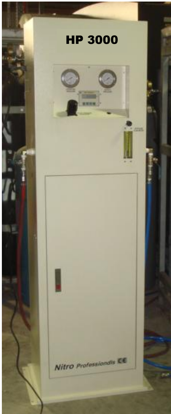
MODEL HP3000 can produce up to 30,800 Litres of Commercially Sterile 98% pure Nitrogen @ 10 bar inlet air flow per hour.