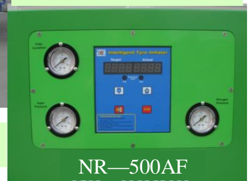
NR 500 AF...with Integrated Automatic Filling Device